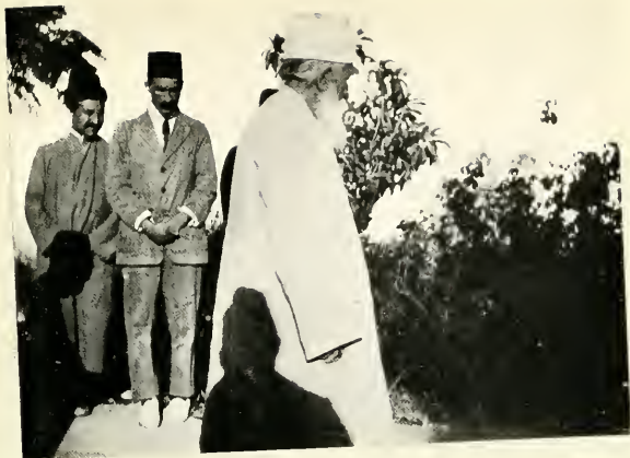
ABDUL BAHÁ WITH SOME YOUNG MEN ON MOUNT CARMEL